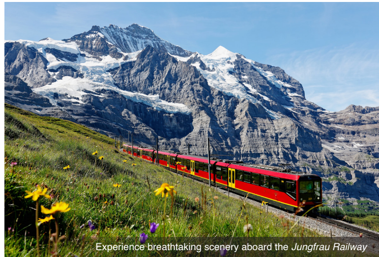
Experience breathtaking scenery aboard the Jungfrau Railway

DAY 1 Depart the USA: Depart the USA on your overnight flight to Zurich, Switzerland.