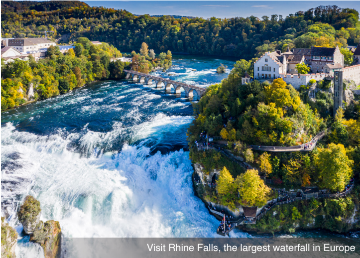
Visit Rhine Falls, the largest waterfall in Europe