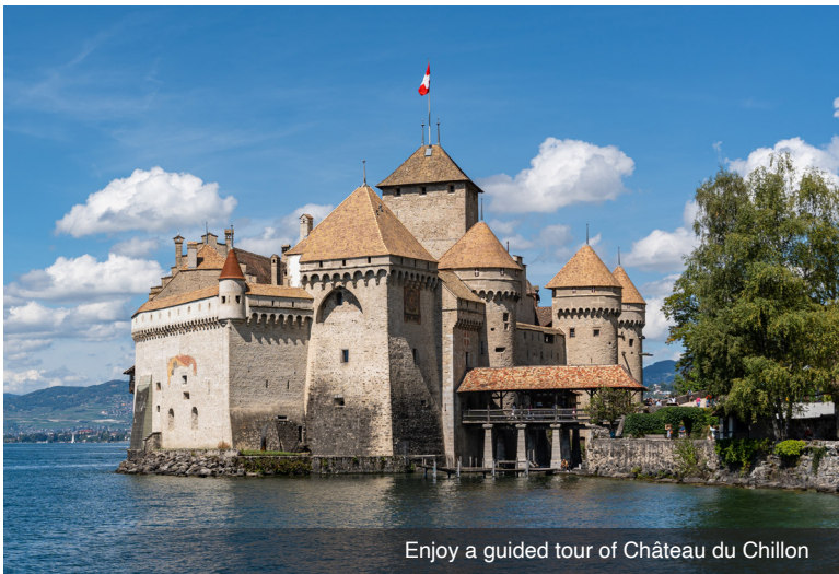
Enjoy a guided tour of Château du Chillon

During free time, walk along the Brunngasse, a street that earned the title of “the most beautiful street in Europe”, and home to many 18th-century houses with wood-carved embellishments. Return by coach to the hotel with the remainder of the day at leisure. Meal: B