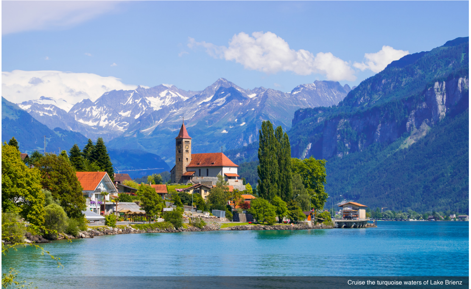
Cruise the turquoise waters of Lake Brienz